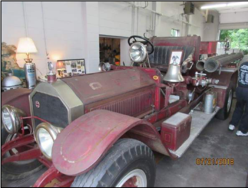
1917 American LaFrance model 45

We stopped for lunch at the Blain Diner, providing time for Ponti-yakking and visiting. We saw some great countryside, and a number of covered bridges, driving across 2 of them. Fortunately the rain held off till late in the day. After returning to New Bloomfield, a mid-year business meeting was held to discuss the convention, as well as remaining activities for the year. It was decided to cancel the proposed private collection tour in October, and schedule a convention update meeting instead. It was noted that Art and Larry will be coming in for the November meeting, and we need to be prepared. After the meeting, a few members joined Don to visit a nearby restored gas station.