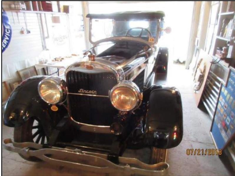
1926 Lincoln Model L Touring from Don Barlup's Collection