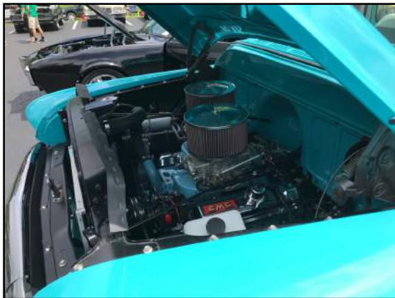
GMC Looking Good at The Dells