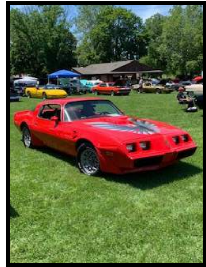
2022 GM on DISPLAY