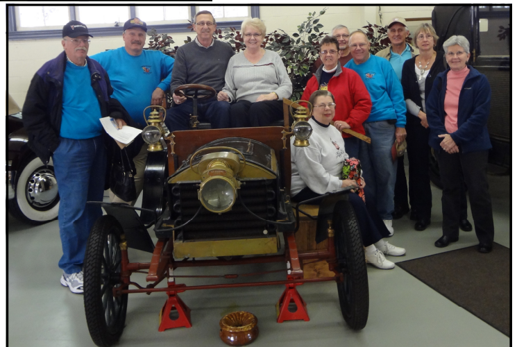
Fall Tour Gang