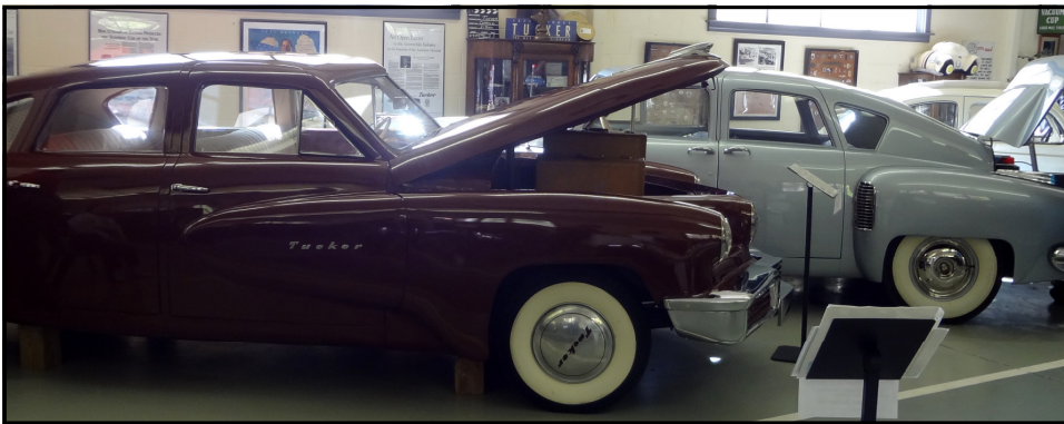
Two Tuckers at the Swigart Museum in Altoona, PA