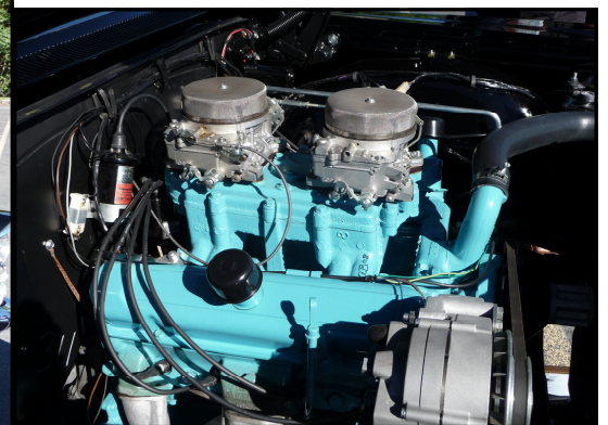
63 Super Duty Muscle