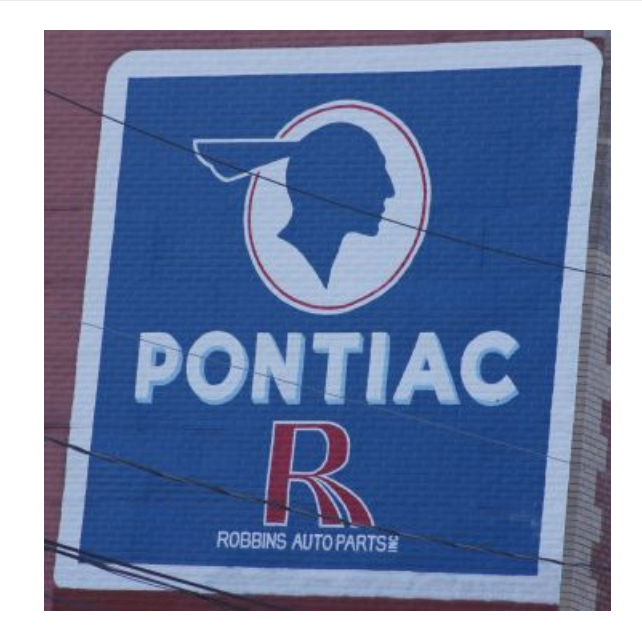
As seen in Dover, NH

IF THE ADDRESS SIDE OF YOUR NEWSLETTER HAS A LARGE RED DOT ON IT THIS IS THE LAST ONE YOU WILL RECEIVE BECAUSE YOU HAVE NOT