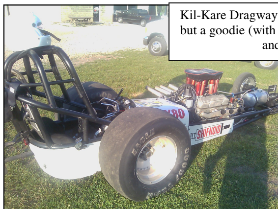
Kil-Kare Dragway, Xenia, OH. 6/16/11. On the left an oldy but a goodie (with updated roll cage). On the right Firebird and new Camaro duke it out