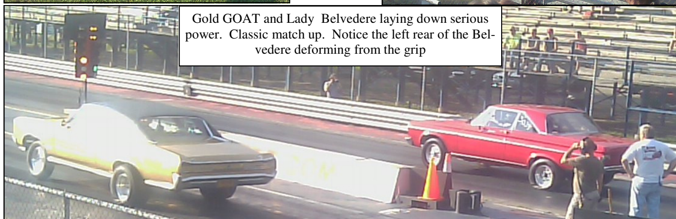
Gold GOAT and Lady Belvedere laying down serious power. Classic match up. Notice the left rear of the Belvedere deforming from the grip