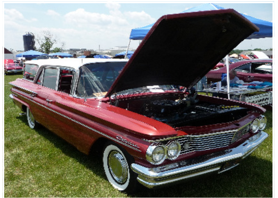
Bill McIntosh's '60 Safari Station Wagon