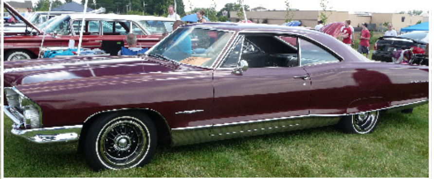
Ed Loos' 65 Bonneville